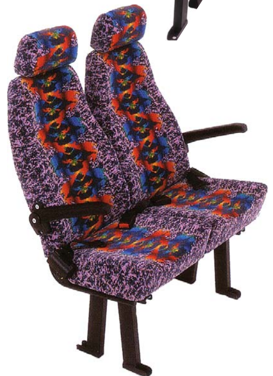
Dimensions (for guidance only)