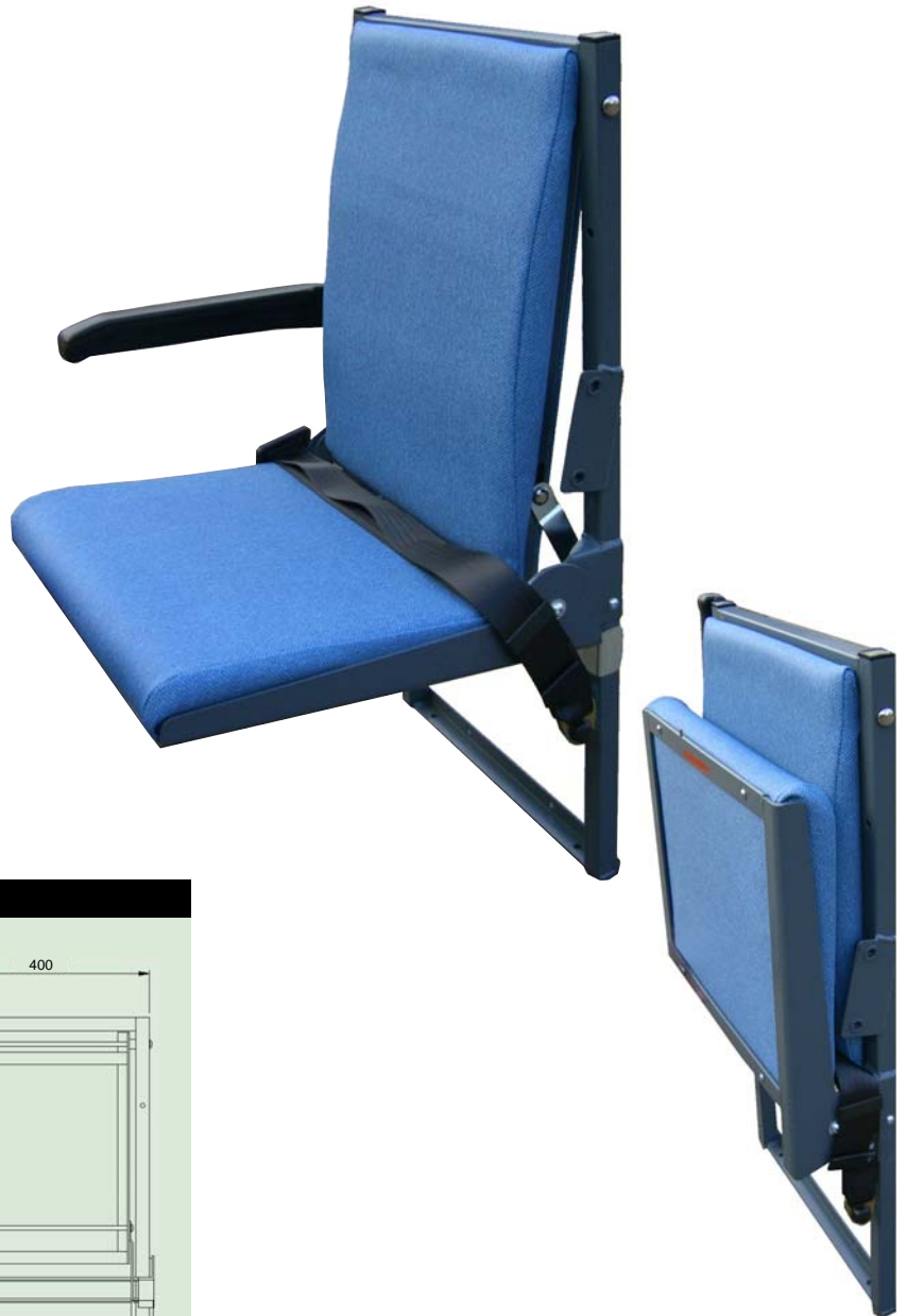
Dimensions (for guidance only)

To match original material in most vehicles. Vinyls and moquettes also available.