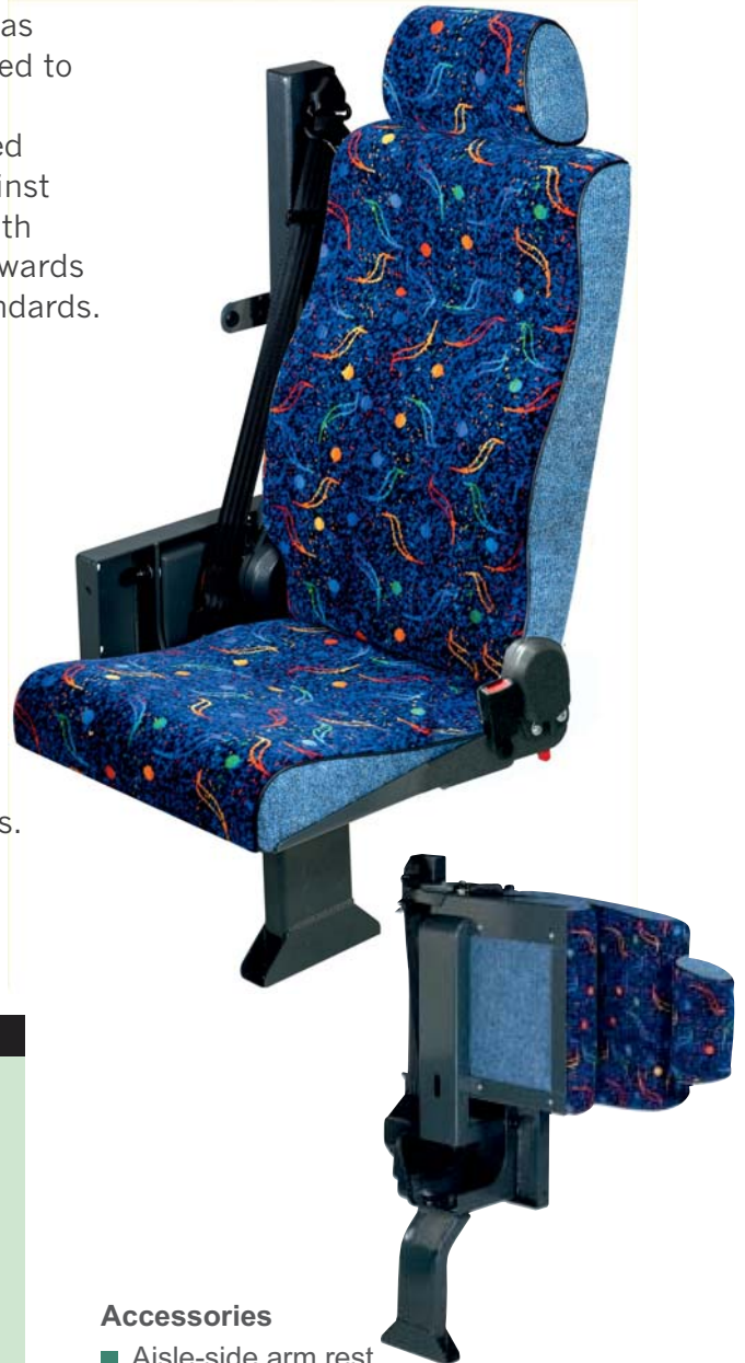
Dimensions (for guidance only)

To match original material in most vehicles. Vinyls and moquettes also available.