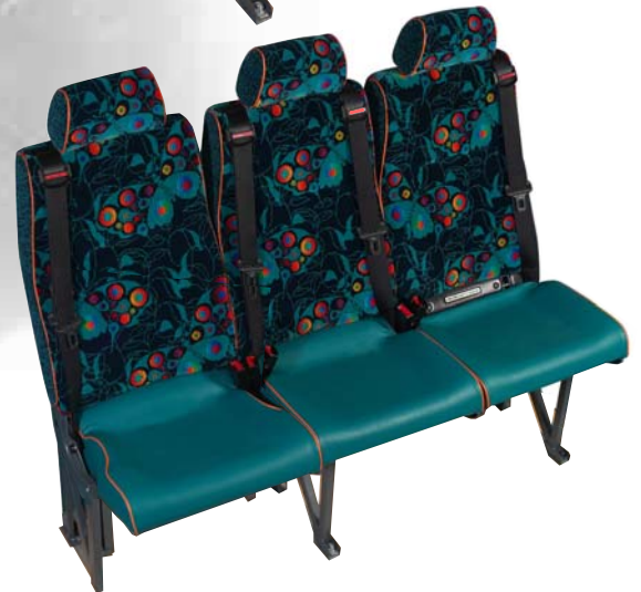
Dimensions (for guidance only)