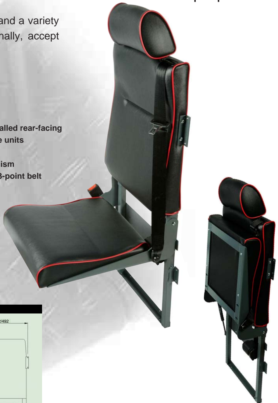
Dimensions (for guidance only)